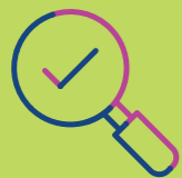
Audit & Assurance Services